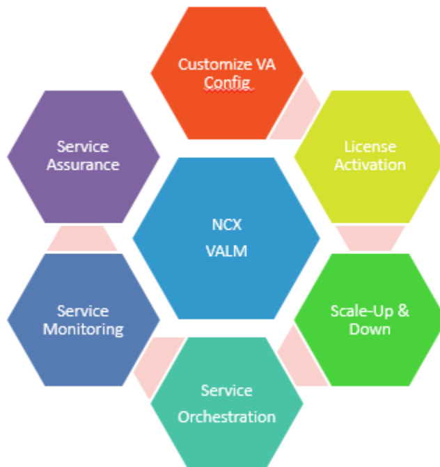
Figure 2 NCX VALM

The following diagram highlights how NCX supports the Virtual Appliance life cycle management: